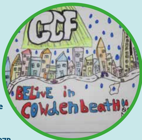
McKenzie Easton - Foulford Primary P7B