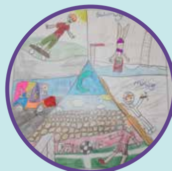
Lacey Allan - P5 St Bride's