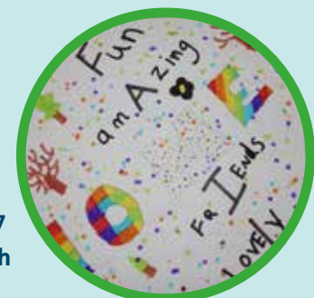
Christina Stobbs - P6/7 Cowdenbeath Primary